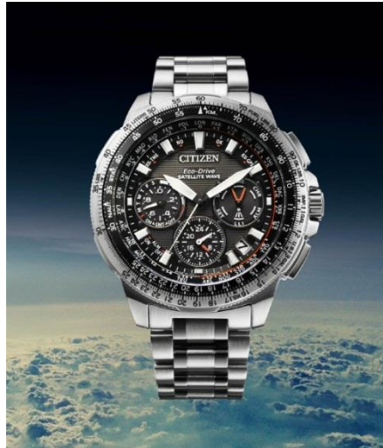
PROMASTER SATELLITE WAVE -GPS CC9020-54E

Inspired by the professional pilot's fearless aspiration for soaring to new heights, the high-end model of PROMASTER SKY series is now available for your wrist.